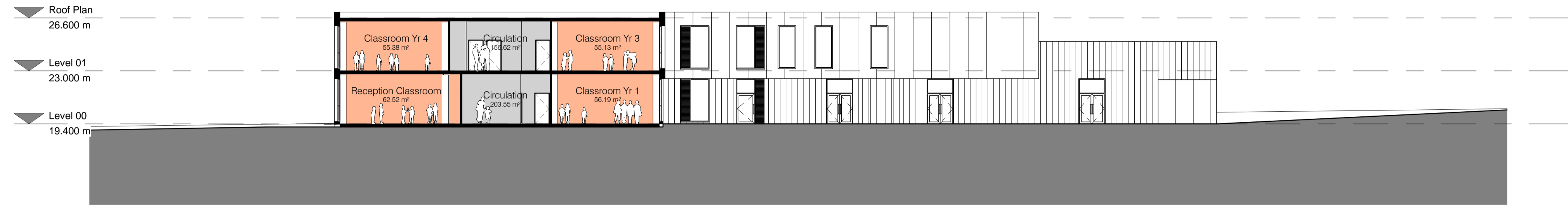
1 Town Planning - Section 1 1 : 200