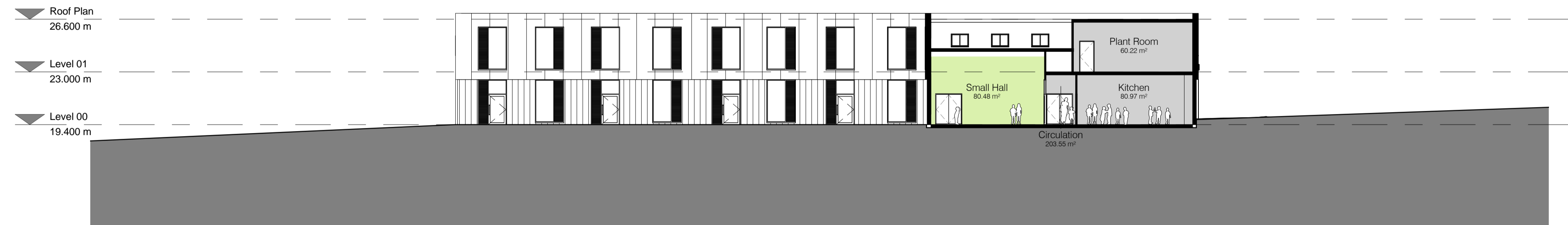
3 Town Planning - Section 3 1 : 200