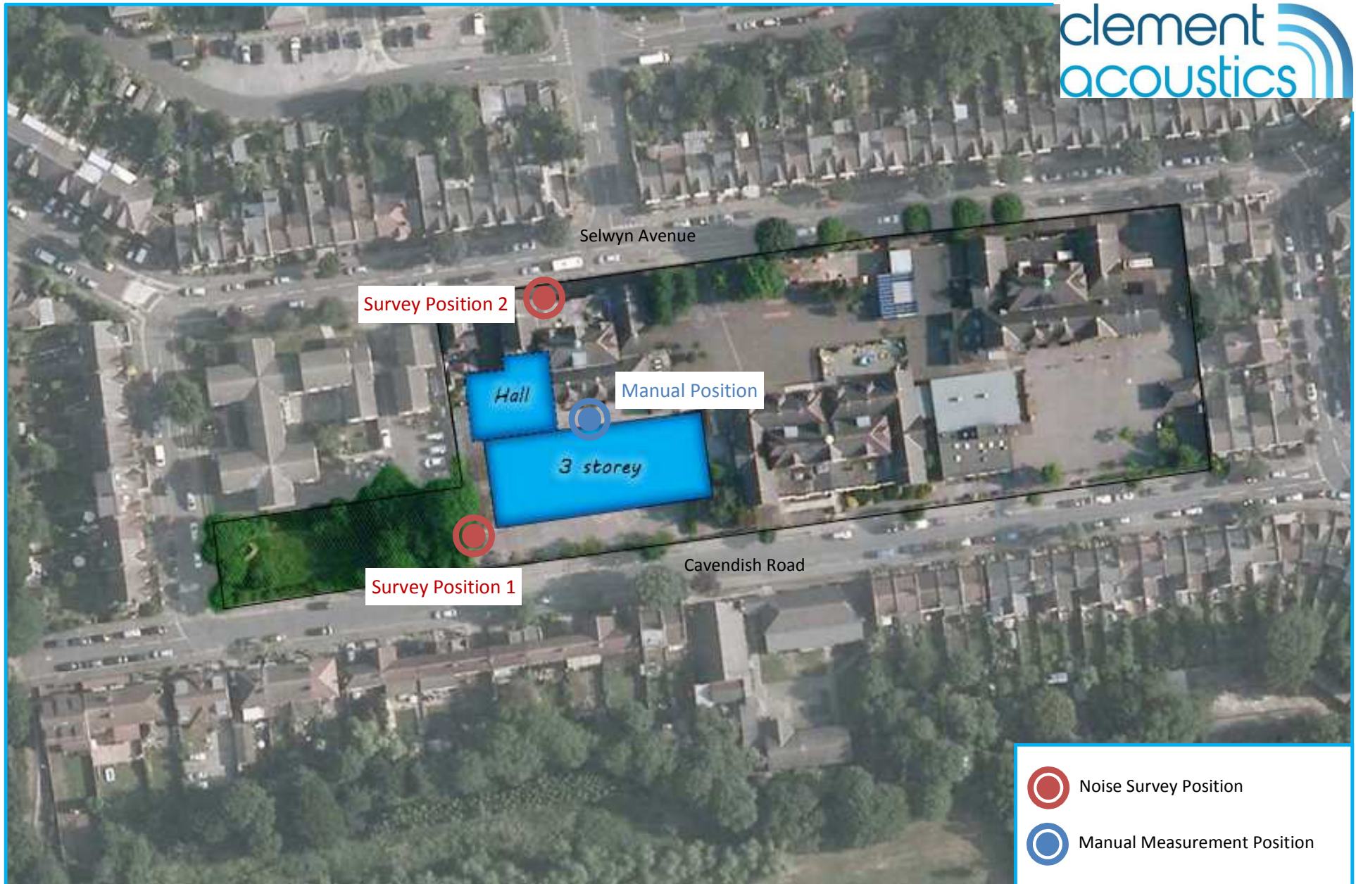
8991-SP3 Indicative site plan showing noise monitoring positions and manual monitoring position